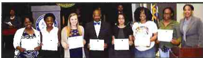
Junior Achievement Volunteers