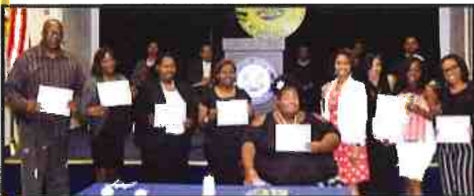
Human Services Internship Awards