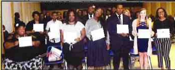
Chancellor's List (4.0)