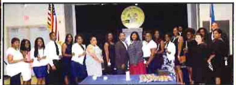
Phi Theta Kappa Inductees