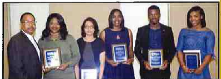
STEM Award Recipients