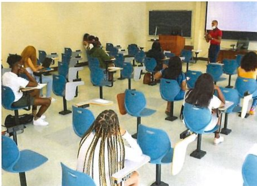
While some classes are online, 26% of the classes offered this semester are traditional with classrooms arranged to ensure the safety of students.

Southern University and A&M College launched the fall semester with students taking online, hybrid, and traditional classes. As the academic units worked with the Division of Information Technology to upgrade classrooms, some of hybrid classes were held remotely.