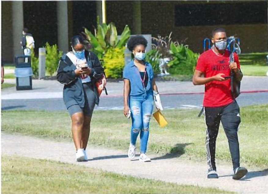
Masks are required on campus for students, faculty and staff.