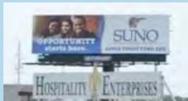
As viewed from the Pontchartrain Expressway (Eastbound & Westbound)