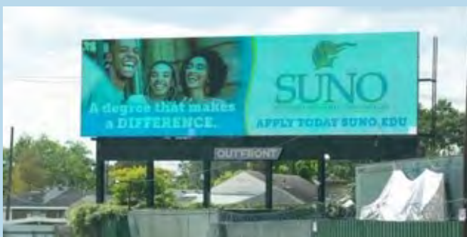
As viewed from I-10 West at Louisa On-ramp