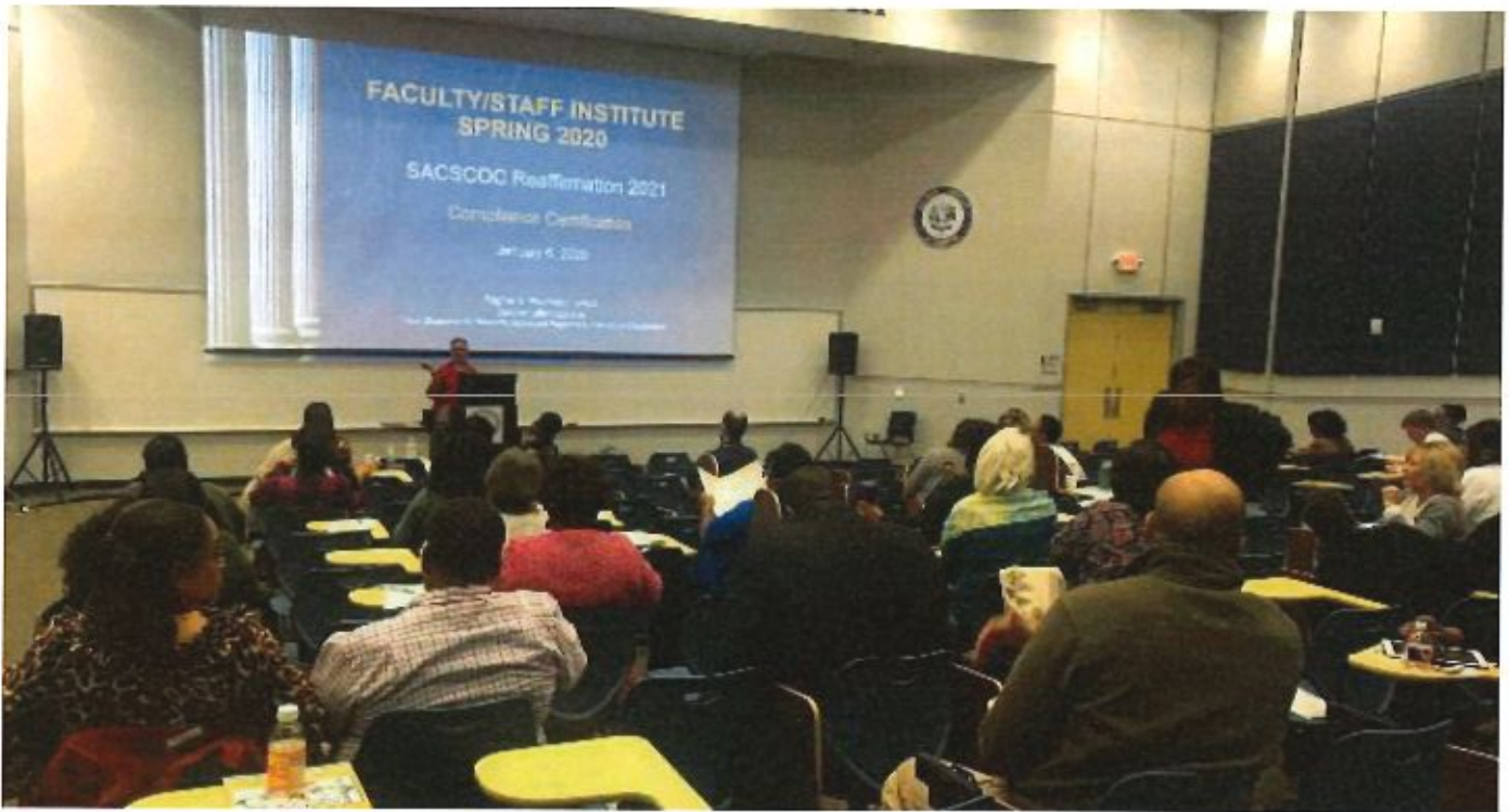
SUSLA Faculty and Staff present at the Spring Institute in the Jackson Building Auditorium.

Southern University at Shreveport (SUSLA) faculty and staff members are committed to the academic and professional success of every student. Collaboration is the surest path to SUSLA's forward progress, and for years, the Faculty and Staff Institute has served as the center point of teamwork and camaraderie on campus. On January 6, 2020, employees gained new perspectives and embraced opportunities for growth at the spring institute "20/20 Vision to Focus and Conquer".