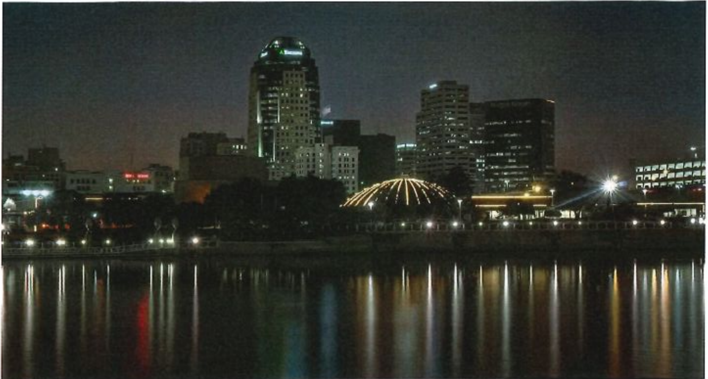
Image of Downtown Shreveport-Bossier where the SCASSI Conference will take place.

Get ready for a fantastic conference take place in the Shreveport-Bossier area, hosted by your very own Southern University at Shreveport. The 2020 Southern Conference on African American Studies, Inc.'s Convention theme is "Quantum Leaps: Black Nationalism, Internationalism, Progressivism, and Power from Slavery through Freedom, 1619-2019." SCASSI's purpose is to interpret African American culture, and share intellectual feedback on its histories, which may sometimes include personal experiences. The conference will take place on February 6-8, 2020, at Sam's Town Hotel and Casino in Shreveport, Louisiana. Register now, by clicking here . There will be additional events, such as presenting research papers, poetry readings, and quiz bowl challenges. One of the biggest events within the Conference is the "SCAASIGras" Mardi Gras Gala, which will take place Friday, February 7. Tickets are only $50. For more information, please contact Dr. Sharron Herron-Williams, Conference Chair, at shwilliams@susla.edu or 318.670.9371.