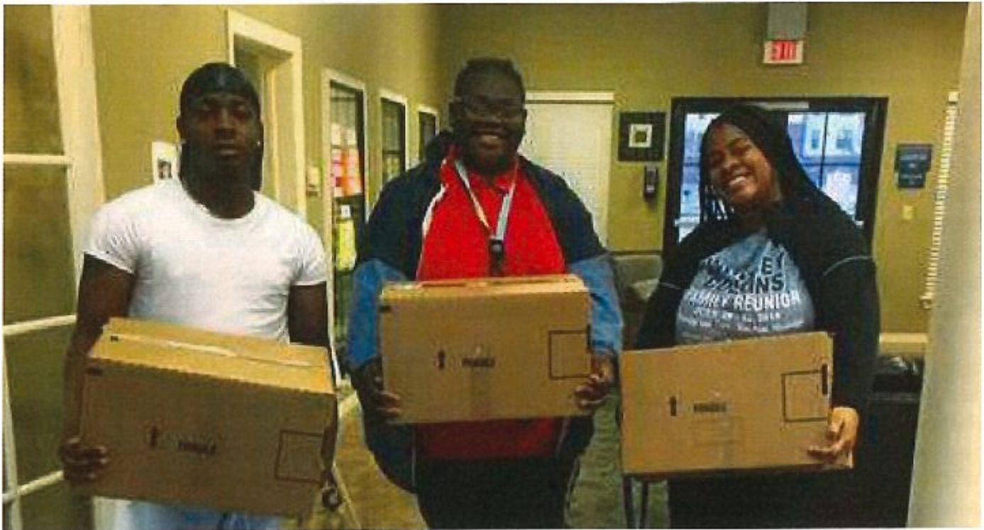
SUSLA students receiving packaged goods during the holidays provided by MS KICK.

The Division of Community and Workforce Development MS KICK program provided meals for 25 students from the Jaguar Courtyard over the Christmas Holidays. These students were not able to make it back home for the Holidays and with the main cafeteria being closed, were offered free meals to assist them over the holiday break. The meals were served daily from Saturday, December 21st, 2019 to Wednesday, January 8th, 2020. The students were provided healthy home cooked meals from the MS KICK Executive staff and comfort food from the MSKICK tenant, Cajun Korner. Some of the meals the MS KICK Executive staff collaborated on included Turkey Tacos, Pizza made with Keto Crust, Turkey Burgers, and Mexican Lasagna prepared with wheat noodles. The MS KICK Executive staff also held demonstrations where students were provided with quick and easy dorm meals, eating healthy on a budget, and overall tips on eating healthier.