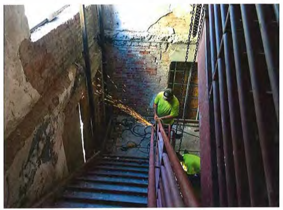
Steel stair framing system in progress