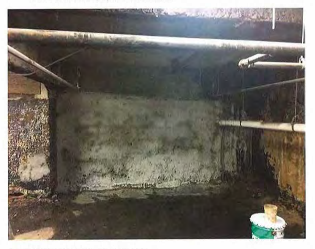
Basement waterproofing in progress