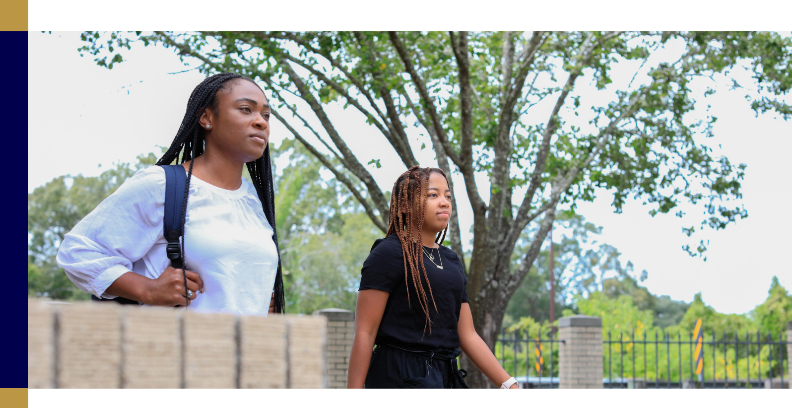
Producing Lawyer Leaders