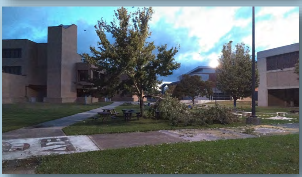
VISIT US ONLINE AT WWW.SUNO.EDU FOLLOW US ON SOCIAL MEDIA: