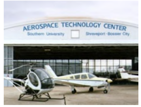
AEROSPACE TECHNOLOGY CENTER 1550 Airport Dr. Shreveport, LA 71107