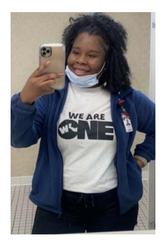
Currently works for Acadian Ambulance Services

Jaguar Scholars is a Department of Labor-funded program that launched here at Southern University at Shreveport. The Jaguar Scholars program was a Job Corp pilot program that was implemented on campus in June 2020. With our community in mind, the program provided youth and young adults options relating to education. The Jaguar Scholars program was intentional in providing youth and young adults the opportunity to attain a certification in twelve months or less in a high-demand field. The Jaguar Scholars program offered a plethora of certifications ranging from computer networking to phlebotomy. In addition, the Jaguar Scholars program was a pathway for students who attended the HiSET program housed at the Metro campus location. Once students completed their HiSET exams, they were given the option to apply for the Jaguar Scholars program to pursue a certification in a desired field.