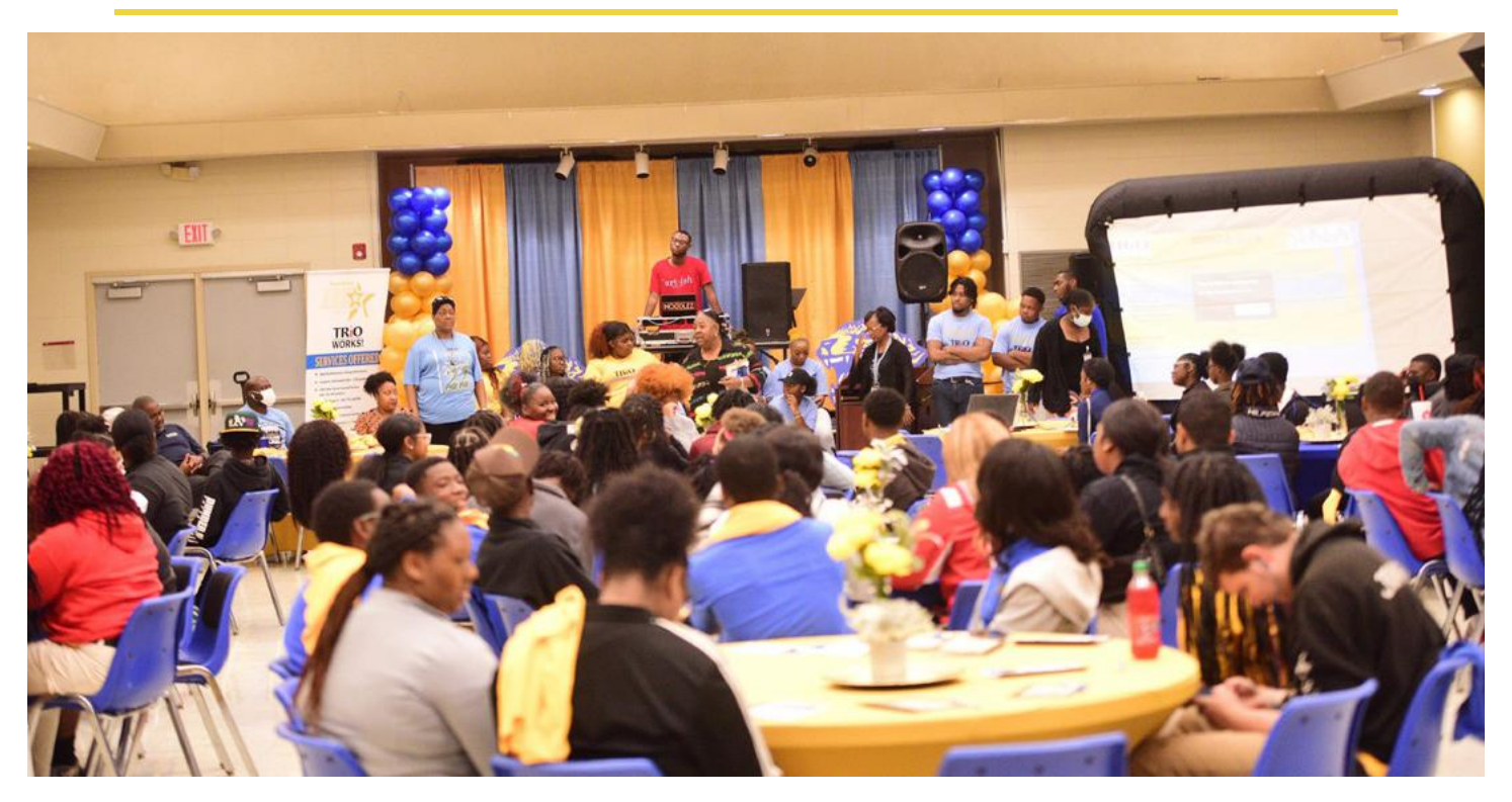
PICTURED: CADDO PARISH HIGH SCHOOLERS ENJOYING THEIR WELCOME TO SOUTHERN UNIVERSITY AT SHREVEPORT BY THE TRIO EDUCATIONAL TALENT SEARCH PROGRAM TEAM

Once again, TRiO's Educational Talent Search (ETS) Program had a very successful SUSLA Annual College Tour and FAFSA workshop! On October 4-6, 2022, ETS hosted the following high schools: Booker T. Washington, Green Oaks Performing Arts Academy, Red River, Magnolia, Arcadia, and Woodlawn Leadership Academy. The 11th and 12th-grade students took an extensive tour of Southern University at Shreveport. The staff from Student Affairs and Enrollment Management, Financial Aid, Students Support Services, Student Activities, and the SGA assisted the ETS staff in hosting visiting students. The members of the SUSLA's cheerleading squad had a dance contest with different dance groups from the visiting schools. This experience allowed our visiting students to meet with SUSLA's staff and complete the Free Application for Federal Student Aid (FAFSA).