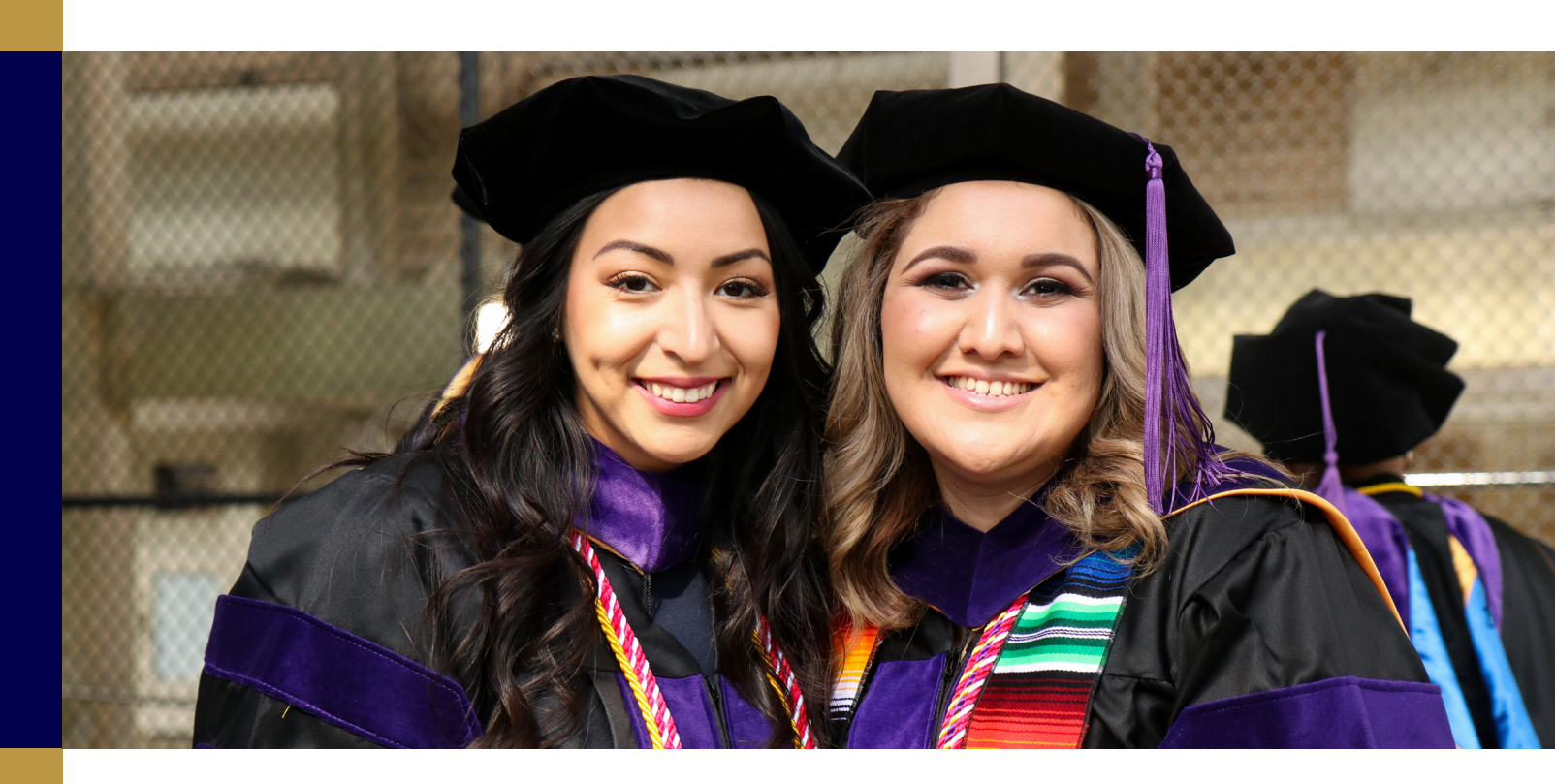
Producing Lawyer Leaders