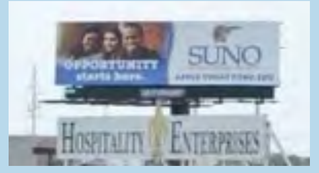
As viewed from the Pontchartain Expressway (Eastbound & Westbound)

VISIT US ONLINE AT WWW.SUNO.EDU FOLLOW US ON SOCIAL MEDIA: