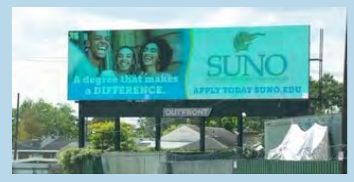
As viewed from I-10 West at Louisa On-ramp