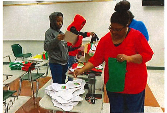
SUSLA Trio Upward Bound Red River/DeSoto are getting in the holiday spirit with residents at the rehab center.