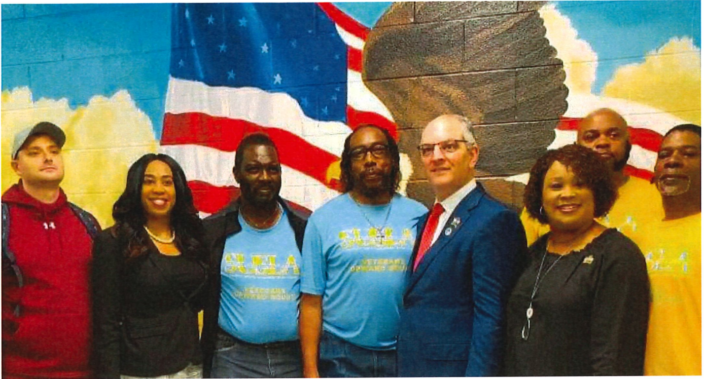
SUSLA Faculty and Staff pictured with Louisiana-elected governor John Bel Edwards.

On Monday, November 11, 2019, the Louisiana elected Governor John Bel Edwards visited SUSLA's LAVetCorps Center located in the Louis Collier Building. The Governor, along with staff, faculty, students, and guests joined in to celebrate those who had served in the Armed Forces. SUSLA's own Veterans Upward Bound Program participants attended the celebration of Veterans Day with the Governor. Governor Edwards was pleased that the University was acknowledging the presence of Veterans on the campus and having the LAVetCorps Center. At SUSLA we will always remember this nation as the Land of the Free and Home of the Brave.