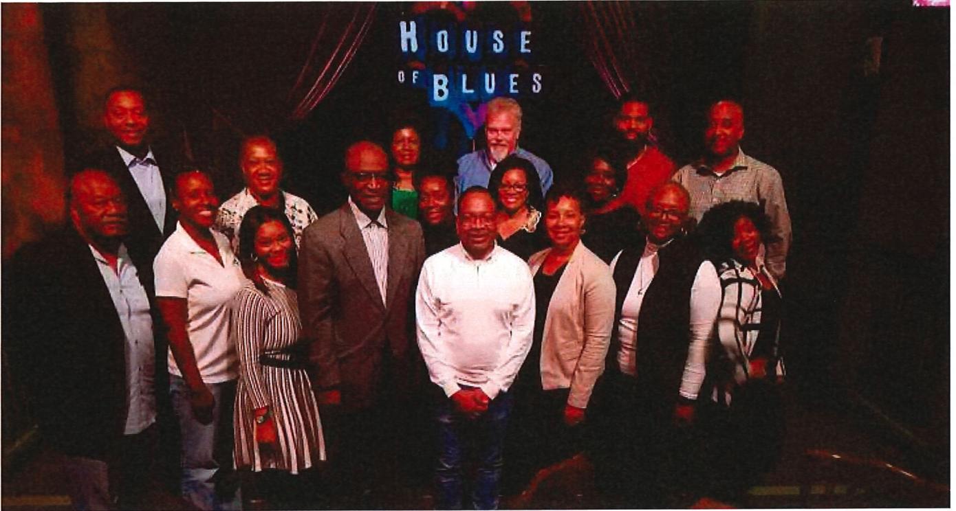
SUSLA Faculty and Staff pictured with members of the Southern University Houston Alumni Chapter.